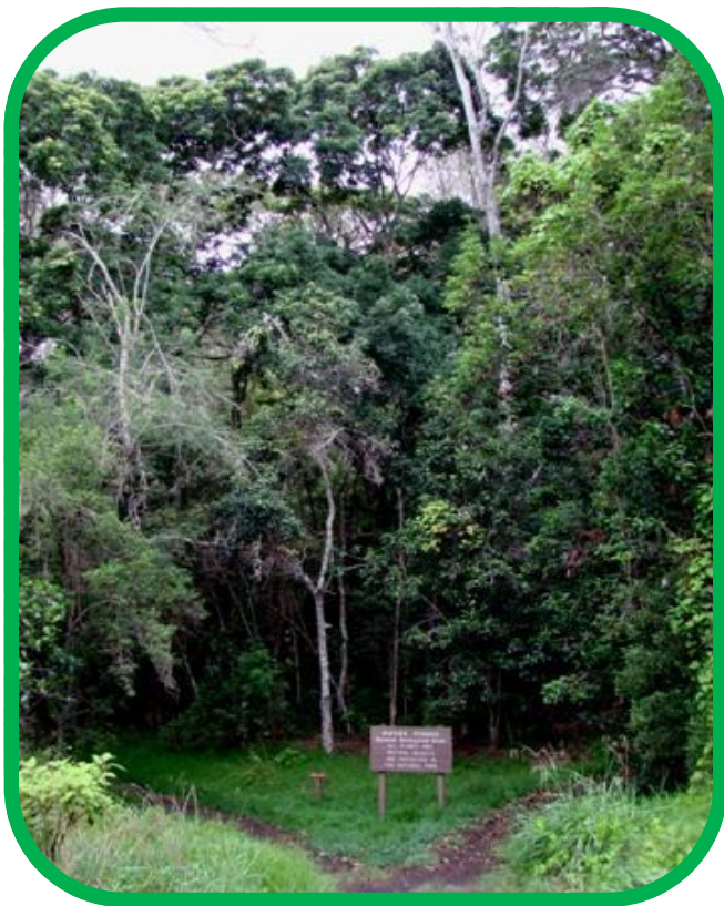
Photo Analysis: Both photos were taken from approximately the same location, but are almost 100 years apart. Cattle, pigs and goats roamed within Kīpukapuāulu until the late 1980's.